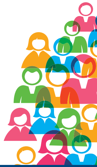
TABLE BOOKING FORM

Wednesday, November 1, 2017 Radisson Blu Hotel, Glasgow